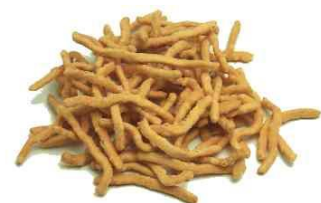
fried chow mein noodles